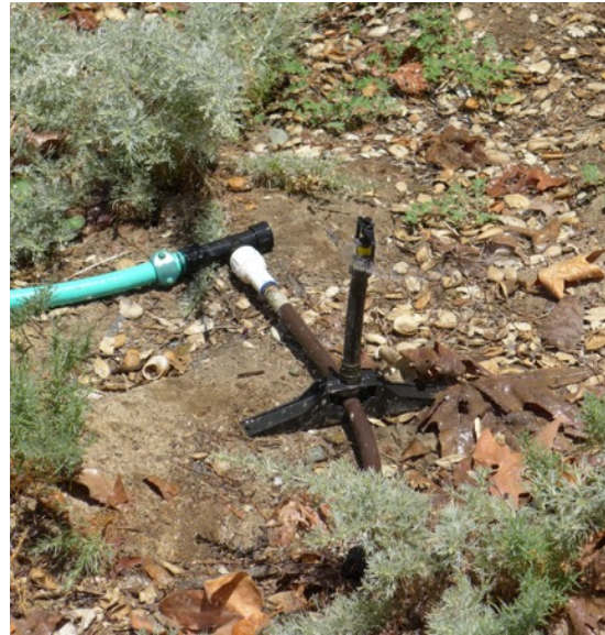
Hose-end mini sprinkler with 9 - foot radius supplies approximately 1/4" precipitation per hour, ideal for cycle/soak or pulse irrigation deep soak

For home landscapes and all small accessible spaces, don't underestimate the simple act of standing with a garden hose and soft rain nozzle and watering your plants by slowly and methodically soaking the soil. It takes a little while but it is time well spent and you will see details in your garden you may miss otherwise. Do this in the early morning or late afternoon, and not in the heat of the day. If you have watering basins and micro-topography built into your planting, this will be an easy way to get a good deep soak. You can water thoroughly about once a month, and include a few light waterings in between if you like, always avoiding the mid-day heat.