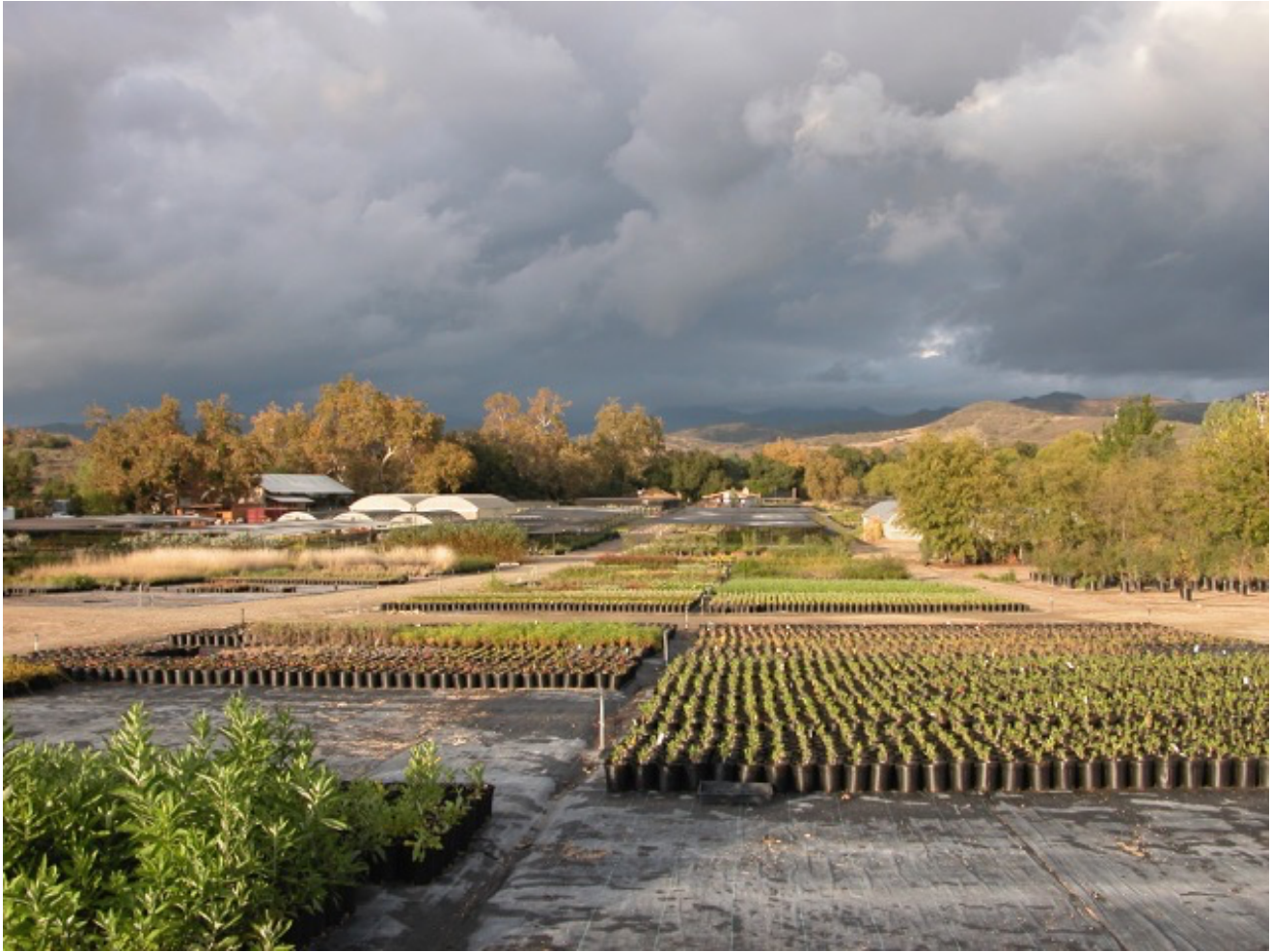
Tree of Life Nursery during a series of winter rain showers.