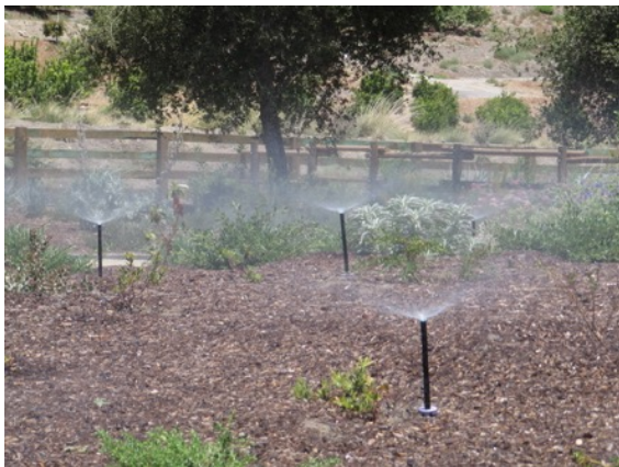
Spray head nozzles apply water at a high rate.

You can estimate your precipitation rate by placing several empty coffee cans in your garden, running the sprinklers for 30 minutes, measuring each can and taking an average, then multiplying by two (since you watered for half an hour) to get the average “inches per hour” factor for your sprinkler system. This will help you know how many minutes you need to apply the recommended 1 - 1.5 inches of water per irrigation event. You can also calculate your precipitation rate if you know the gallons per minute (GPM) flowing through the sprinkler valve as follows: (\text{GPM} \times 96.3) / \text{square footage} = \text{precipitation rate in inches} .