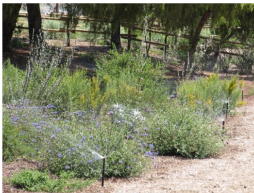
Stream rotor nozzles apply water at a low rate.