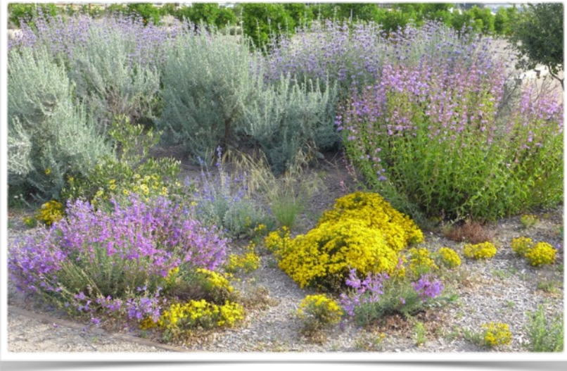
Flowering native plants watered once a month in summer

Plants use water to cool themselves and to grow. Plants draw water in through their roots and transport it through their entire system and those roots grow in soil. Different plants have different water needs. Plants can absorb some water through their leaves as well, though most natives are adapted to not need this source of water in the summer months.